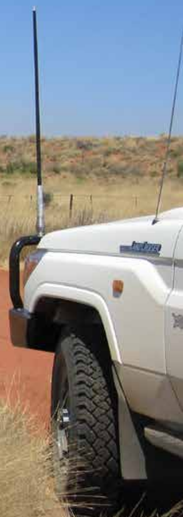
Ethabuka Nature Refuge, Channel Country

Nature refuge Ethabuka This is a protected area under the Nature Conservation Act 1992. Access is only by permission of the land-holder.