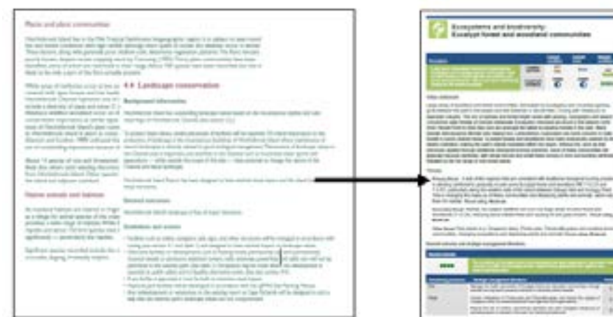
The Hinchinbrook Island National Park management plan from 1999 (left) compared to the new look values-based management plan

Images: a values based approach at Currawainya NP 2012 (left) 2017 (right) banner: Daintree National Park; left: Tony Groom in his natural habitat; below: Lamington National Park.