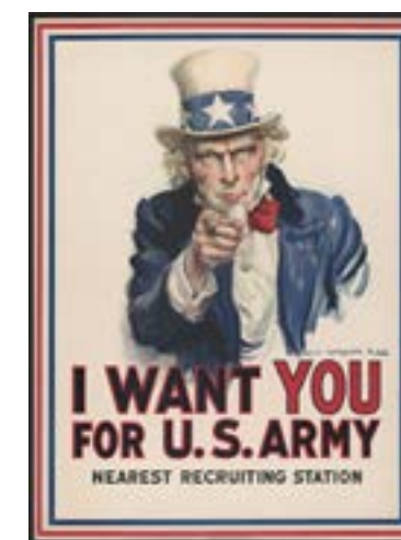
Queensland's national parks need you too.

We can help with editing, images and content. Email us to find out how: admin@npaq.org.au