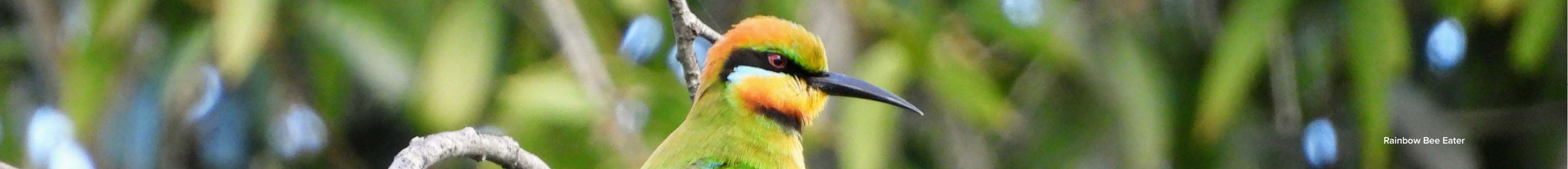
Rainbow Bee Eater