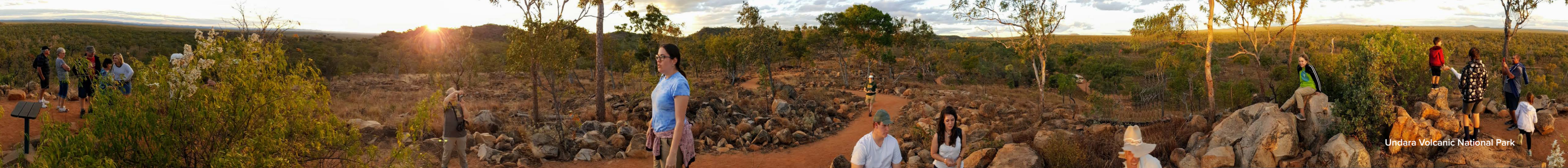
Undara Volcanic National Park