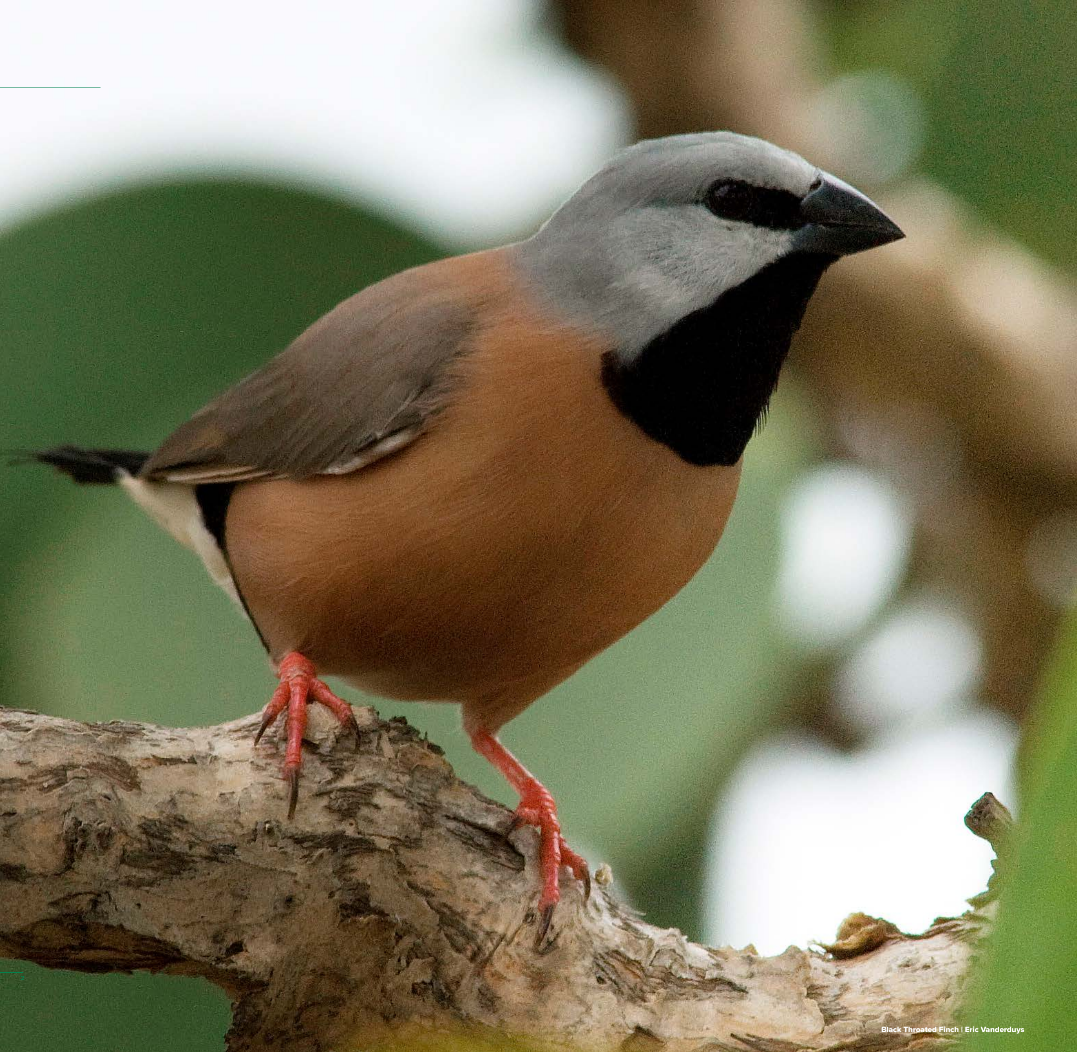
Black Throated Finch | Eric Vanderduys